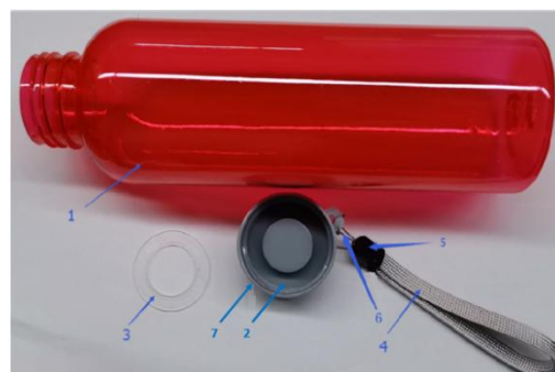
1, 2, 3: direct food contact

The following substances subject to restrictions and/or specification are used in the above-mentioned product. The materials and raw materials used comply with Regulation (EU) No 10/2011.