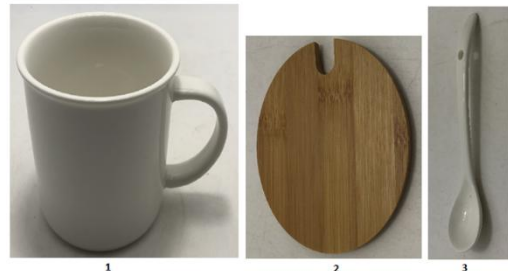
1, 2, 3 : direct food contact