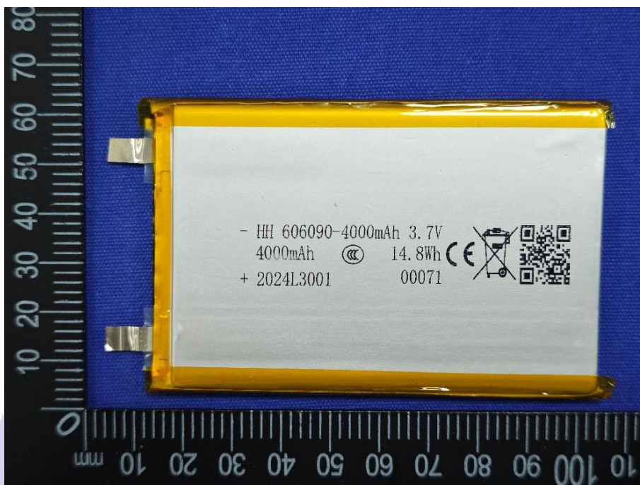
Photo 1 Front 正面