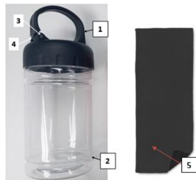
1, 2 : direct food contact

MOB /MO9203 PO BOX 644 6710 BP (NL) PO 41-XXXXXX Made in China