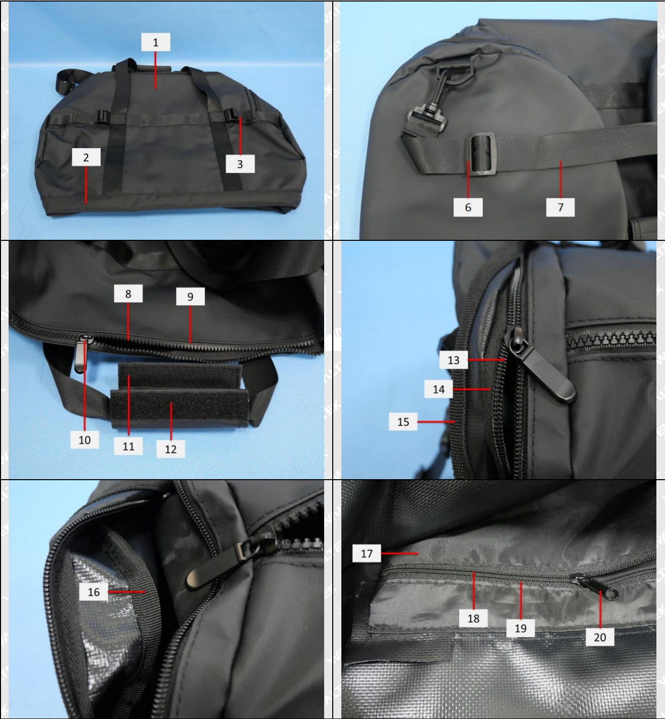
Photograph of parts tested: