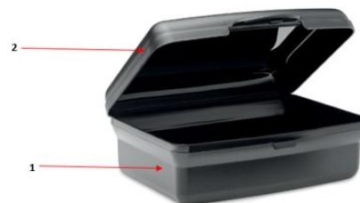
1, 2 : direct food contact

The following substances subject to restrictions and/or specification are used in the above-mentioned product. The materials and raw materials used comply with Regulation (EU) No 10/2011.