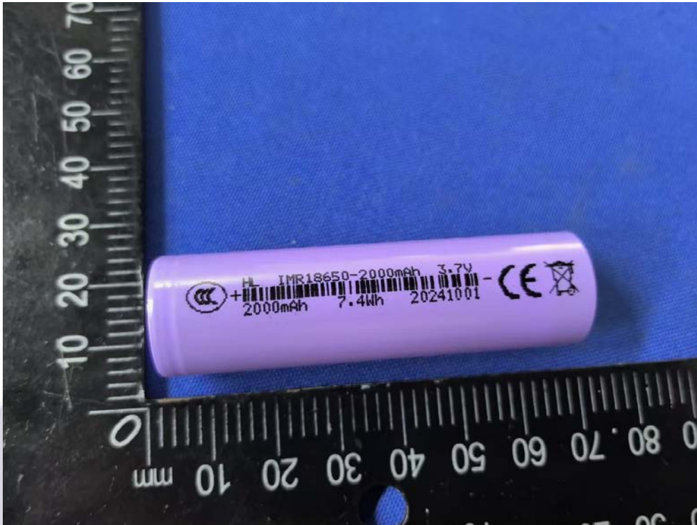
Picture 1. Front view of cell 图片 1. 电池前视图