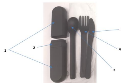
3, 4, 5 : direct food contact

The following substances subject to restrictions and/or specification are used in the above-mentioned product. The materials and raw materials used comply with Regulation (EU) No 10/2011.