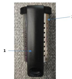
2 : direct food contact

The following substances subject to restrictions and/or specification are used in the above-mentioned product. The materials and raw materials used comply with Regulation (EU) No 10/2011.