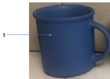
1: direct food contact