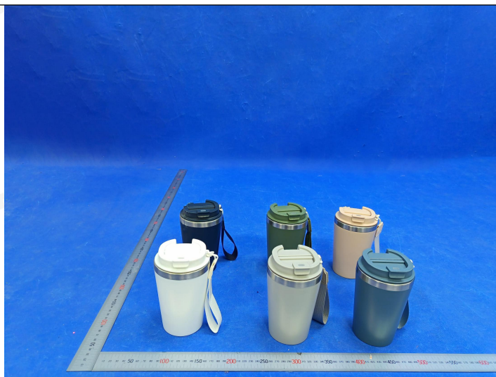
Product Photo, For reference only