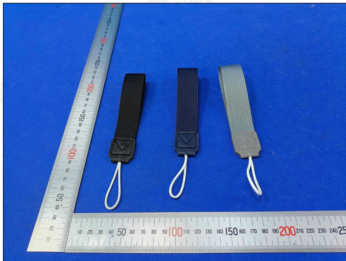
Test Sample Photo